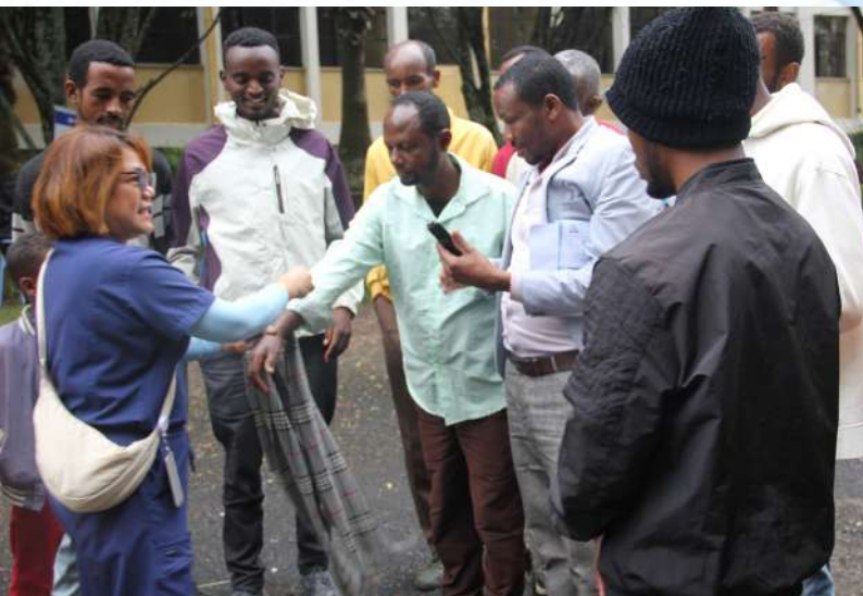
Health professionals from Negele Arsi General Hospital and Medical College share insights on first aid

generous sponsorship of several organizations and departments, including the Theology Department, EAC Clinic, EAC Counseling Department, Health Principles Students, Sociology Students, Negle Arsi General Hospital and Medical College, and the Wondogenet Research Center who also donated several medicinal and herbal plants. The purpose of planting a variety of medicinal and herbal plants was not only to beautify our campus but also to provide our community with natural remedies and potential income sources through the cultivation and sale of these plants.