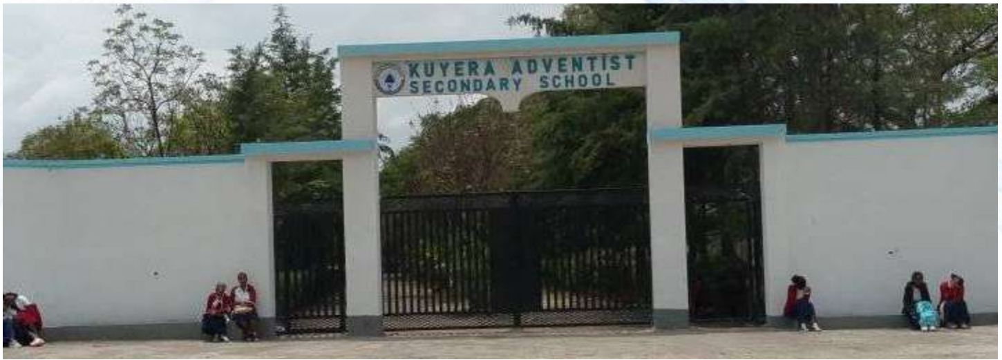
The newly constructed main gate for Kuyera Adventist Secondary School

T he main gate and fencing of Kuyera Adventist Secondary School (KASS) were constructed with 1.5 million Birr from the operating funds of the college. The new gate and fence for KASS provides a safe environment for our high school students, staff and teachers. The previous gate and fence were dismantled to accommodate