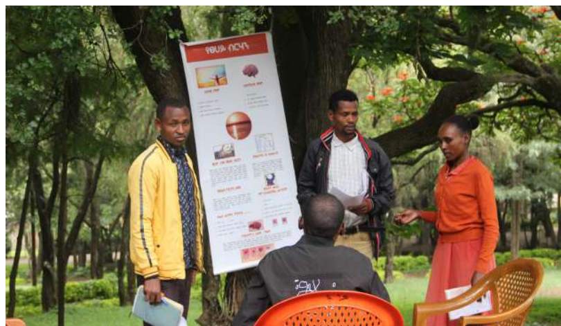
Students sharing NEWSTART health principles