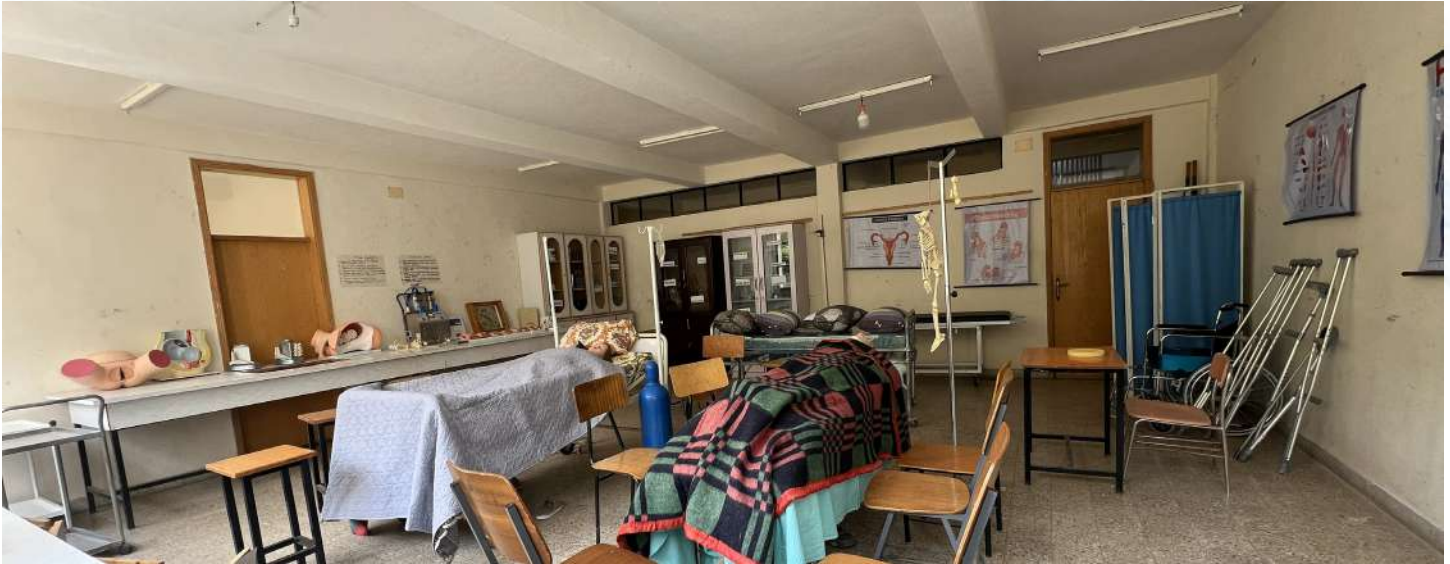
Some of the equipment for the Clinical Nursing Lab

Ethiopia Adventist College (EAC) is proud to announce the official launch of two new Technical and Vocational Education and Training (TVET) programs, Clinical Nursing and Pharmacy. After a rigorous evaluation process conducted by the Labor and Skills Office, the college has successfully met all necessary requirements and has been granted full recognition to operate these new programs.