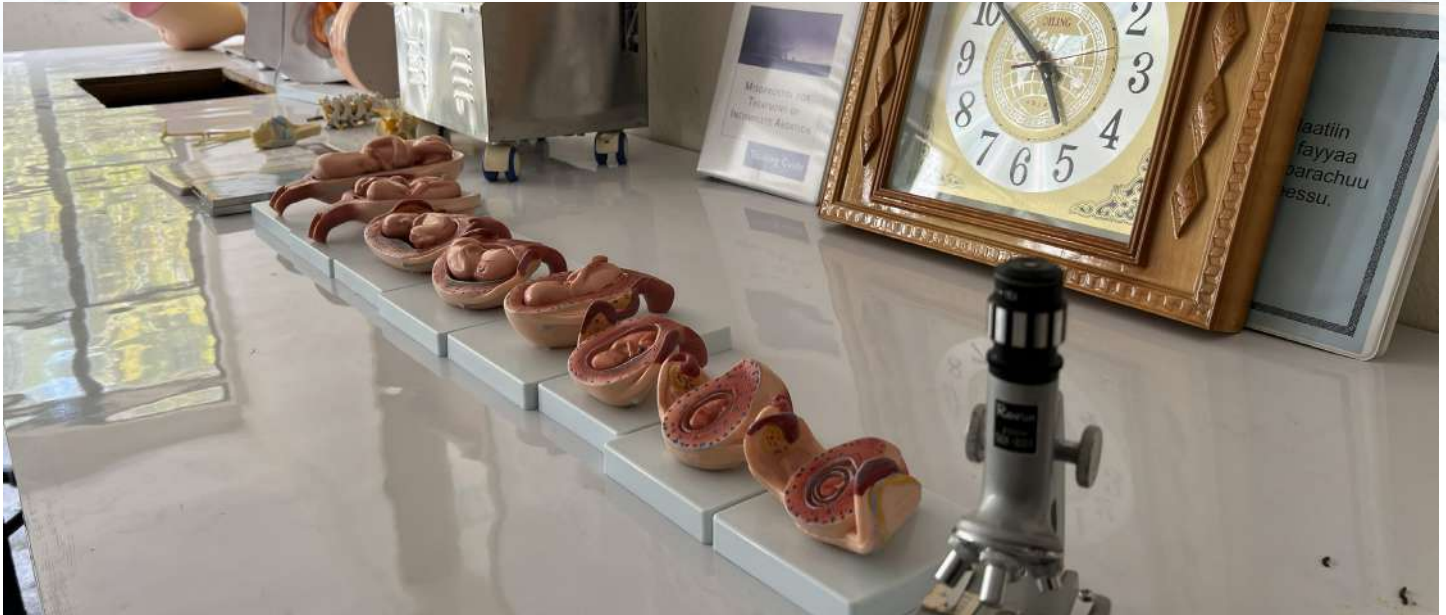
Some of the equipment for the Clinical Nursing Lab