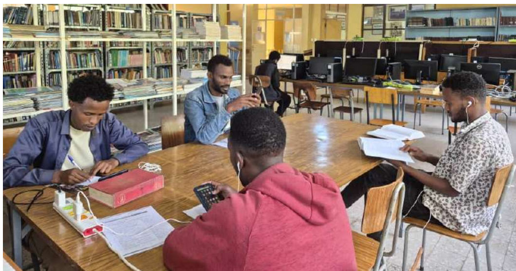
EAC students studying at the Ethiopia Tadesse Library

In sum, these initiatives the constant passion of the EAC Ethiopia Tadesse Library to fostering academic interests among students and patrons, equipping them with the necessary knowledge and skills for future success in the rapidly evolving technology landscape. The Ethiopia Tadesse Library cares the well-being of its patrons both today and tomorrow