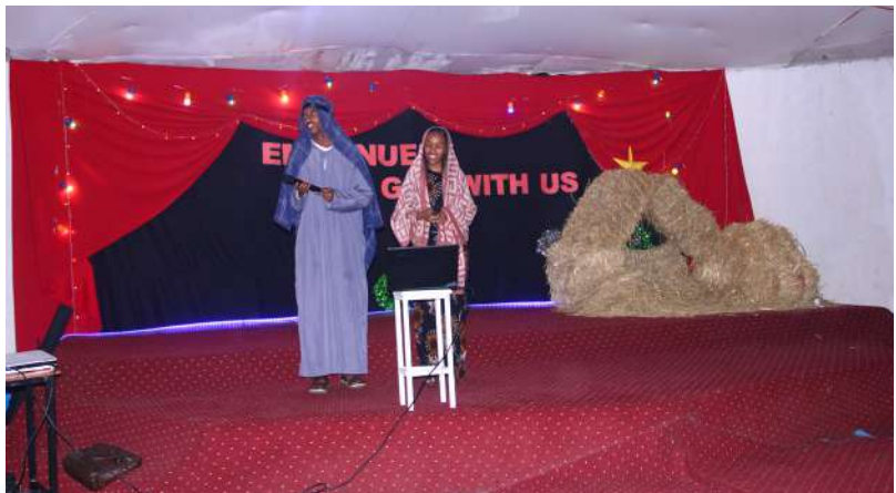
Students leading the song service