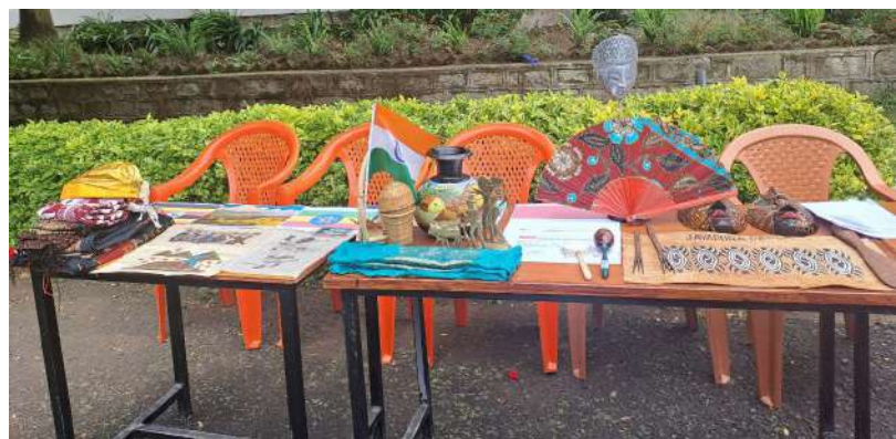
Cultural artifacts from several countries on display.