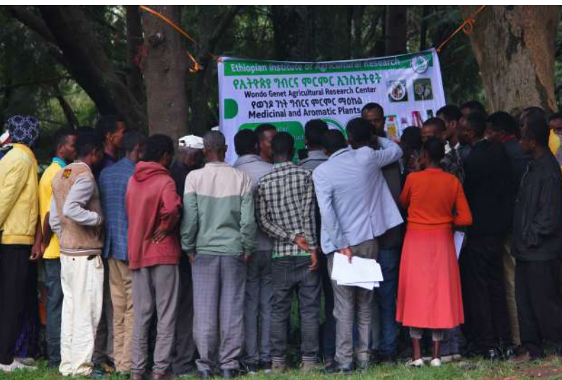
The Wondogenet Research Center showcased several medicinal and aromatic plants. Many people were interested to learn from them.

Overall, the event successfully encouraged community members to take charge of their health while promoting cultural exchange and unity. It was a day filled with learning, connection, and celebration—an event truly worth attending.