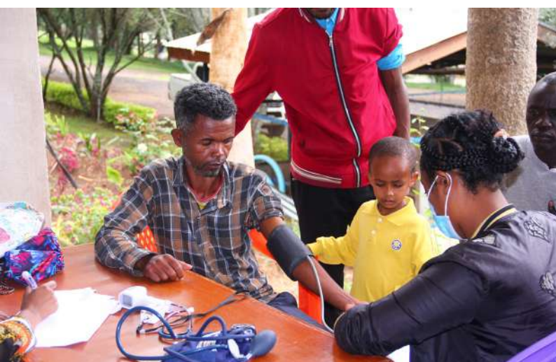
Health professionals from Negele Arsi General Hospital and Medical College checked the blood pressure for the visitors