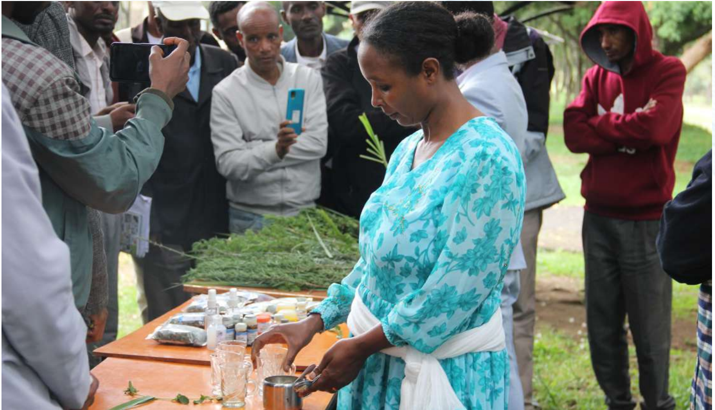
Professionals from Wondogenet Research Center demonstrate the use of a variety of herbs for good health

A lively and impactful health Expo that left a lasting impression on all attendees was held on Friday, August 29, 2025. The community gathered in front of Toppenberg Hall for the event that began around 9:00 AM till 12 noon and was a celebration of health, education, and cultural diversity.