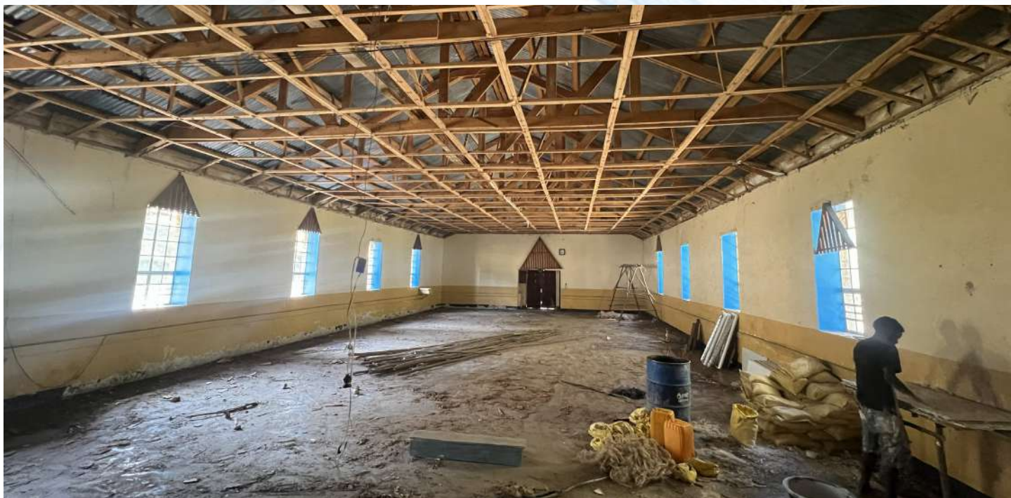
First phase of renovation for the Ethiopia Adventist College Church

T he Ethiopia Adventist College (EAC) Church has stood for many years as a place of worship, guidance, and spiritual renewal. Since its establishment, it has been a great blessing to all who have passed through EAC—students, staff, missionaries, and visitors—whether they came to study, to serve, or to support the mission of the Church.