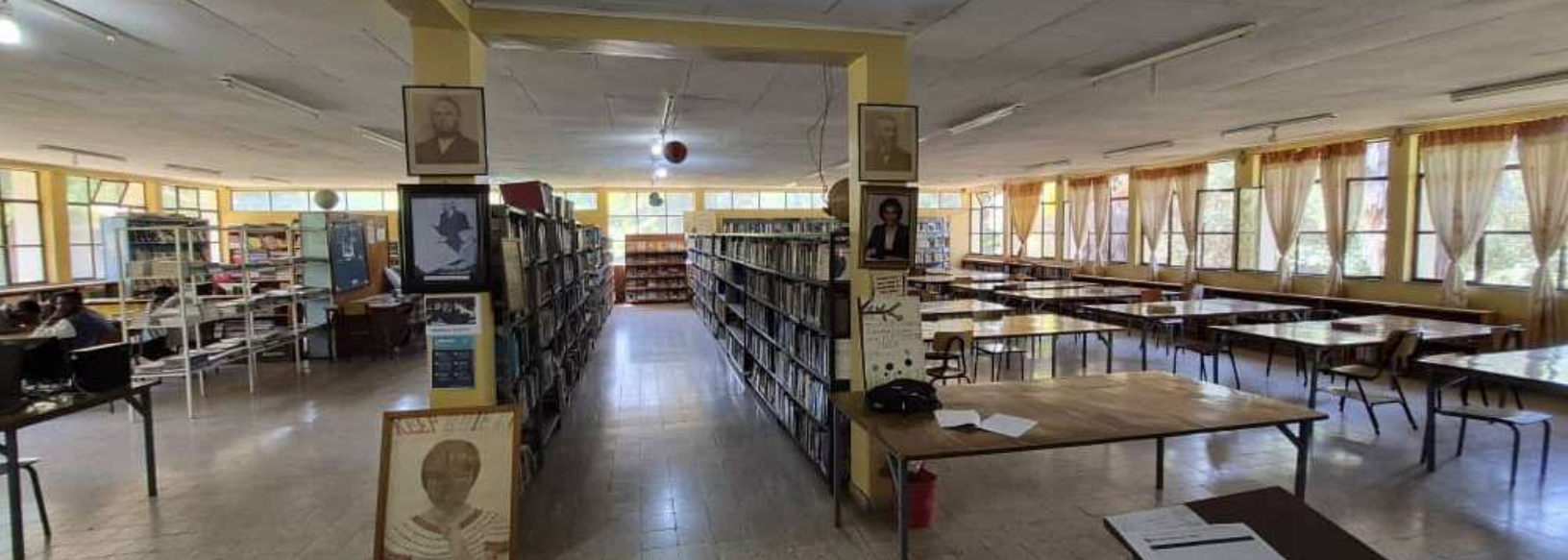
Front view of Ethiopia Tadesse Library