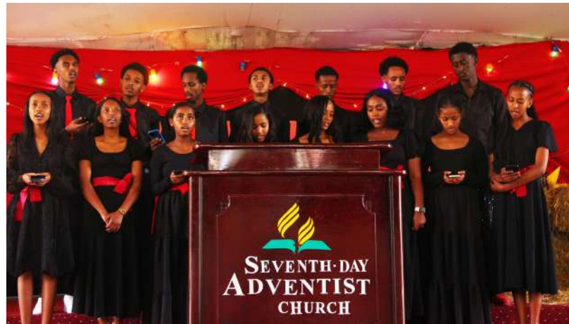
Advent Choir presenting during the program

The Advent Choir joyfully sang "New Star Shining," "O Holy Night," and "The First Noel," celebrating the birth of our Savior. The younger children presented songs such as "What Child Is This," along with other hymns praising God for His marvelous gift. We give praise to God for our young people, especially The Advent Choir, who took leadership in the weekend worship. May God continue to bless them as they use their gifts and talents in His service.