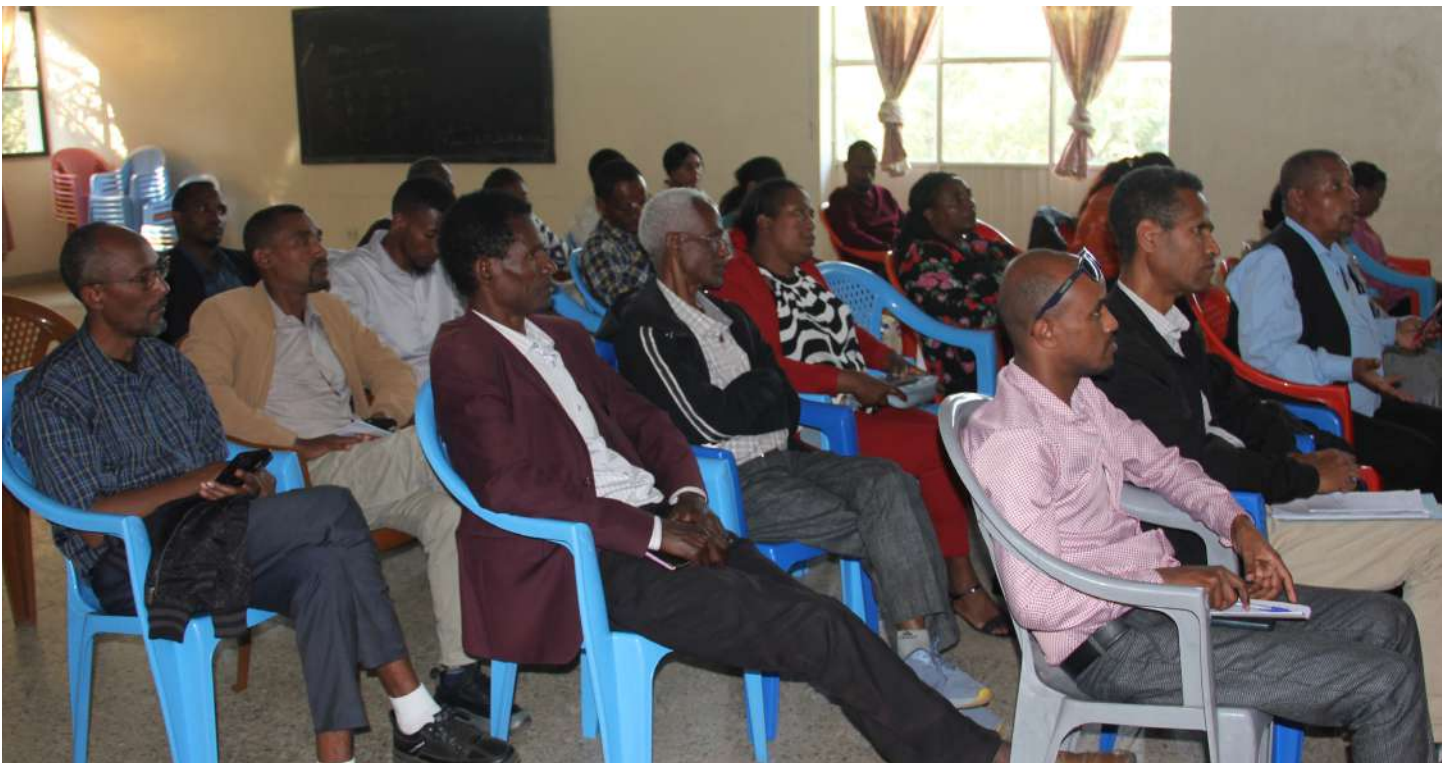
Faculty and staff of EAC listening intently at the seminar.

The seminar concluded with the realization that diversity is a source of strength, not a challenge; that active effort is necessary to promote inclusion; and that harmony arises from respect, empathy, and collaboration. Valuable lessons were imparted during this training, and it is hoped that our classrooms and workplaces will become more harmonious environments for study and work.